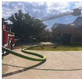
(Mutual-Aid to Mason)