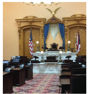
Floor of the Ohio Senate