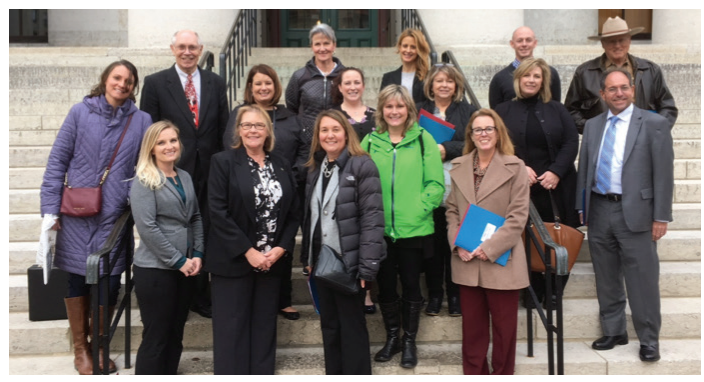
November 2019 Columbus Excursion