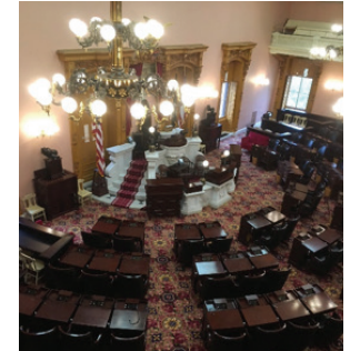
Floor of the Ohio House of Representatives